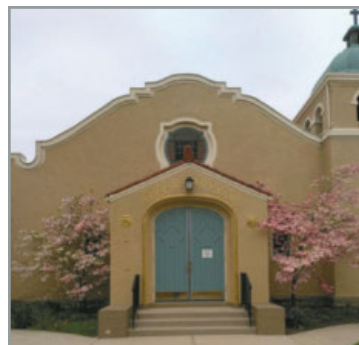
Corpus Christi Church