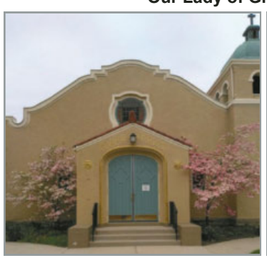
Our Lady of Grace Parish (OLOG)

"We, the members of the Holy Spirit Family of Parishes, will foster discipleship by making the Eucharist the center of our lives as we form, live, and share our faith."