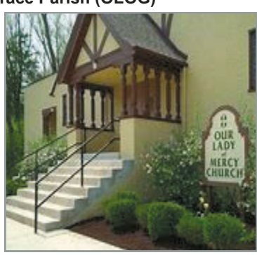
Our Lady of Mercy Church