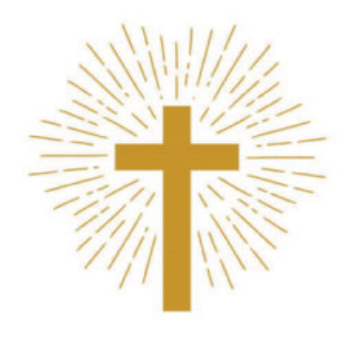
Easter Vigil at SB 2024