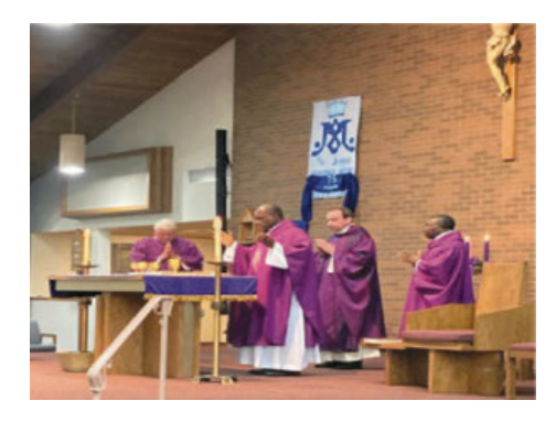
Together Mass at QM 2023