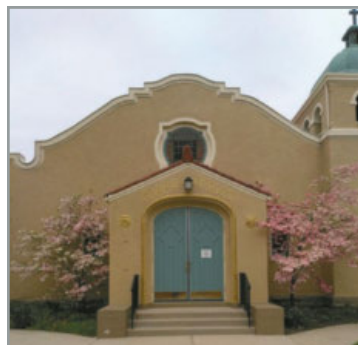
Corpus Christi Church