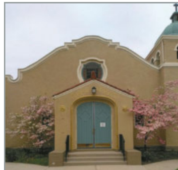
Corpus Christi Church