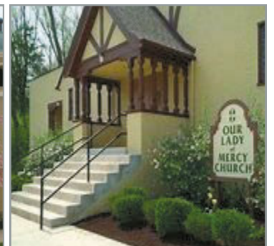
Our Lady of Mercy Church