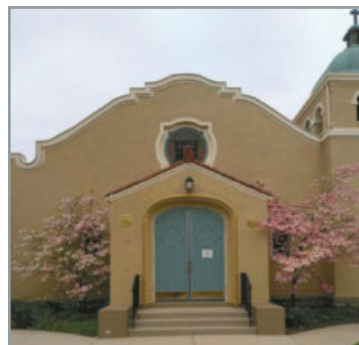
Corpus Christi Church