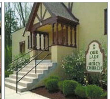
Our Lady of Mercy Church