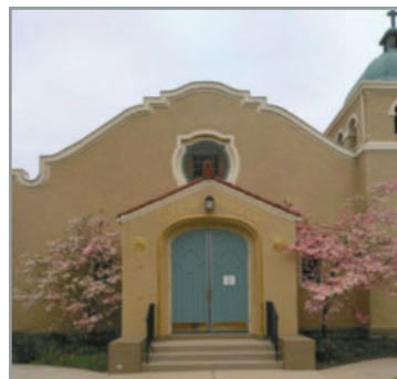
Corpus Christi Church